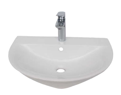
Faucet not included